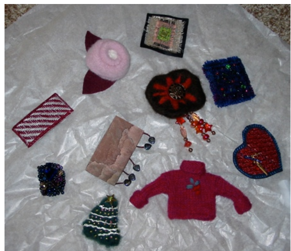
Creative Pins Made by Members

After several interesting show and tells, the meeting was adjourned and the pin exchange was begun. There were great examples of member creativity in the pins that were exchanged.