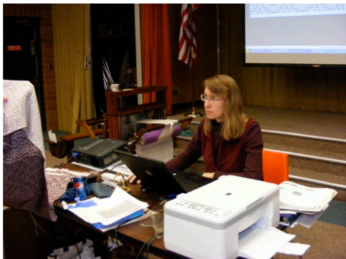
Vila did a great job of leading the study.