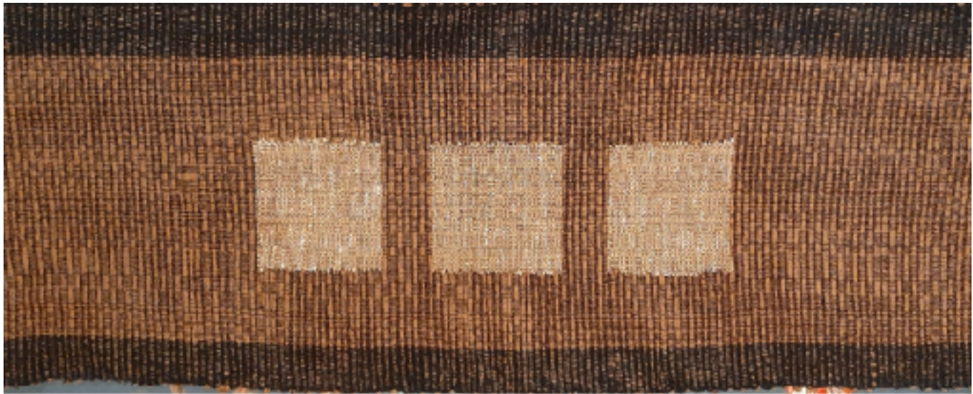
Table runner I made for my sister since Christmas.