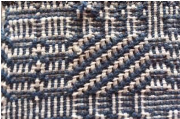
Shadow Weave, by Irene Chandler