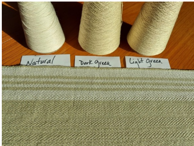
Table Runner with different treadling