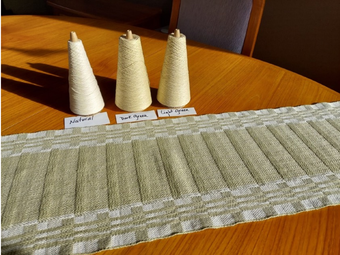
Sword Fern & Horsetail Table Runner