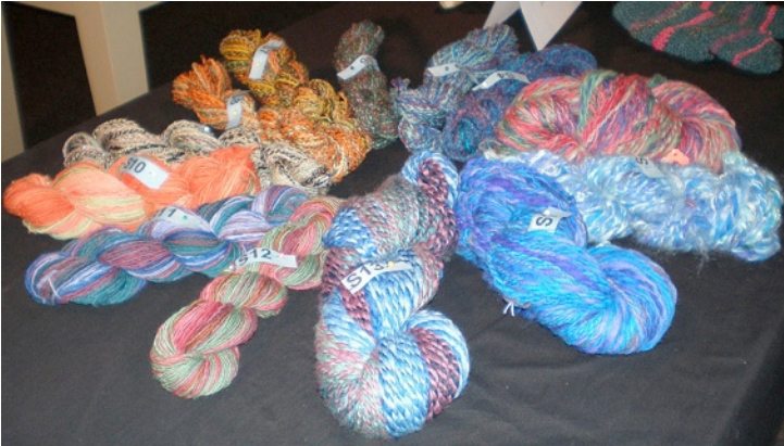
All the Skeins - Fuzzy and Colorful are the Winners