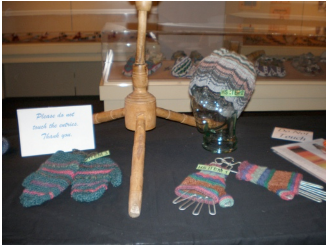
Finished from Handspun